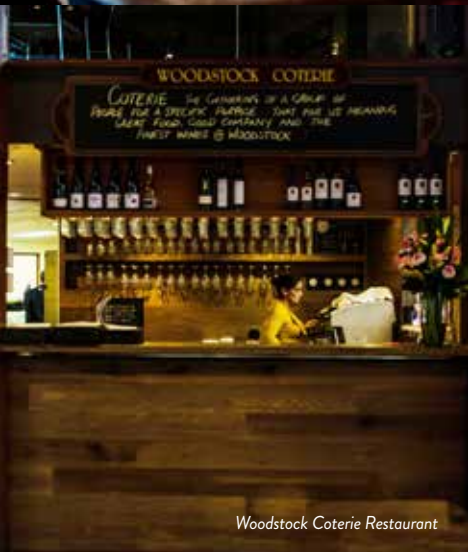
Woodstock Coterie Restaurant