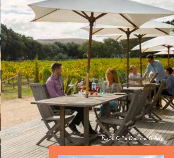
No 58 Cellar Door and Gallery